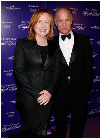
Ed Harris & Amy Madigan 2009 Inaugural Purple Ball