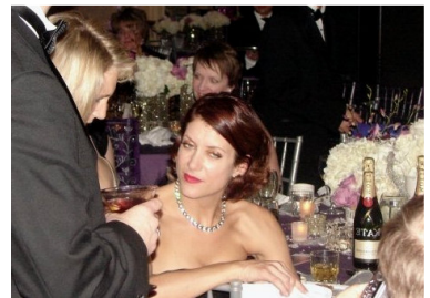
Kate Walsh 2009 Inaugural Purple Ball

Additional Celebrity Guests Included: musician Herbie Hancock, and actors Hill Harper, John Cusack, David Allen Grier, Elizabeth Shue, David Guggenheim, Dionne Warwick and Chris Lowell.