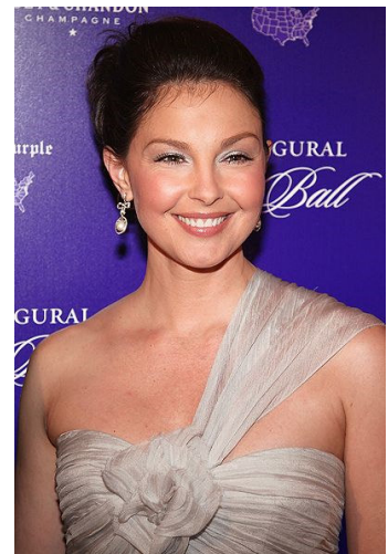
Naomi Judd 2009 Inaugural Purple Ball