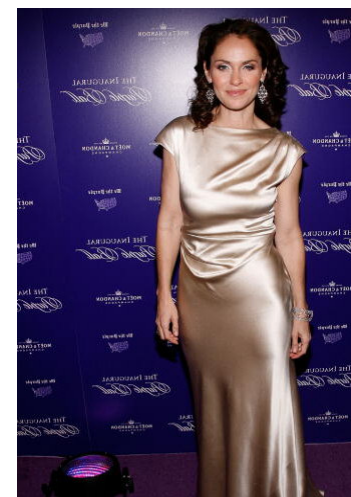
Amy Brenneman 2009 Inaugural Purple Ball