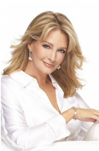
Deidre Hall Actress

One of America's most beloved actresses, Deidre Hall's career spans daytime, primetime, theater, and film. She has remained a trusted entertainment icon for more than 30 years, bringing a cache of name recognition, reliability and integrity. She believes in herself and she inspires others – from all walks of life – to have faith in their individual abilities and encourages all to follow their dreams and to never give up.