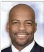
ASSEMBLYMEMBER ISADORE HALL, III 52ND ASSEMBLY DISTRICT