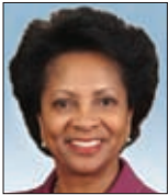
ASSEMBLYMEMBER WILMER AMINA CARTER 62ND ASSEMBLY DISTRICT