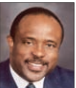
STATE SENATOR RODERICK D. WRIGHT 25TH SENATE DISTRICT