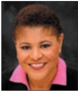
SPEAKER EMERITUS KAREN BASS 47TH ASSEMBLY DISTRICT